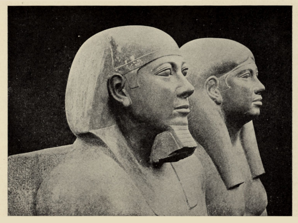
Upper Part of Slate Group: Mycerinus and His Queen, Fourth Dynasty

was prosperity, there came union between the different tribes and the whole of Egypt came under the rule of a single sovereign. The holding of the wealth in the hands of a single family resulted in the expenditure of the surplus in great public works which took the form of tombs of kings, etc., enormously costly even with slave labor, and in Egypt there were alternate periods of financial depression and wealth. This is shown in the tombs, for the implements attending the interment in the midst of a panic in Egypt were inferior in quality and number. The graves thus tell after many centuries much of the financial story of the country.